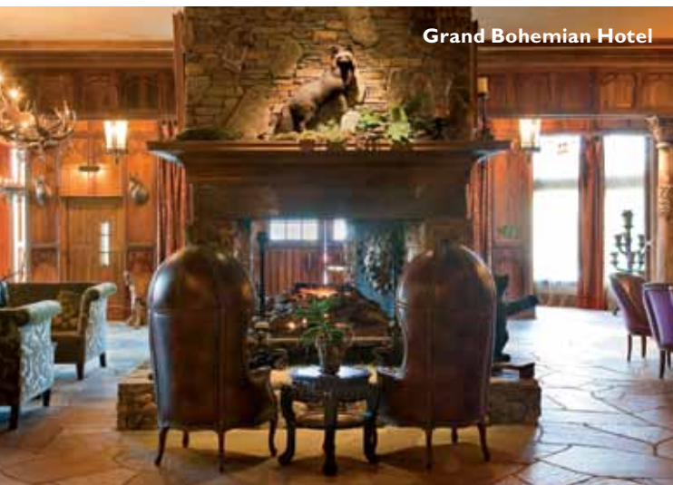
Grand Bohemian Hotel

Grand Bohemian Hotel Located in Biltmore Village, stuffed trophies, artwork, antler chandeliers, and a stone fireplace accent this atmospheric hotel (from $289). bohemianhotelasheville.com ↗